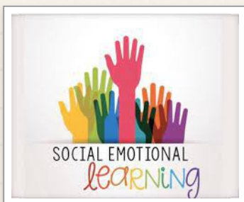
Social Emotional Learning